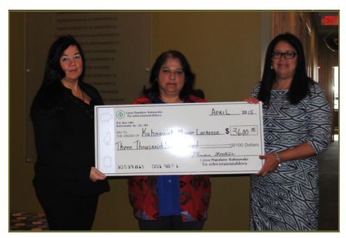
Kahnawake Minor Lacrosse $3,600