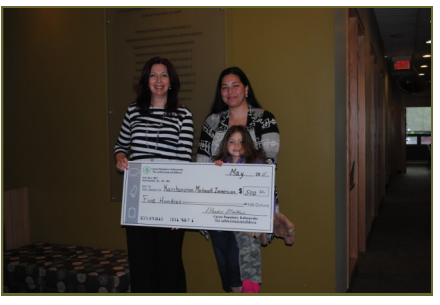
Karihwanoron Mohawk Immersion Golf Tournament $500